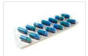
Pharmaceuticals & Chemicals