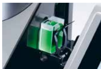
Measurement of liquids in transmission

For liquids, glass or plastic cells of up to 60 mm path can be used, including 12.5 mm standard glass cells when using the optional adapter.