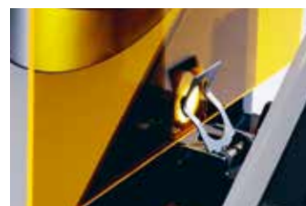
Measurement of solids in transmission