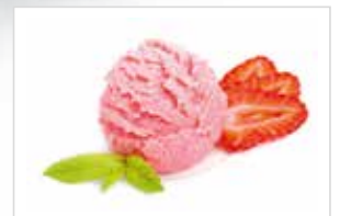
Food & Ingredients