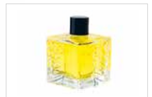
Cosmetics & Perfumes