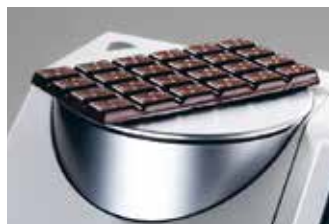
Reflection measurement of solids

Samples in paste, powder or granule form can easily be measured with the optional Petri-Dish set.