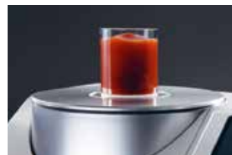
Reflection measurement of paste products

➔ Simply sliding the top cover, opens the large transmission chamber to measure all kind of transparent liquids or solids, such as foils or glass plates in Transmission mode.