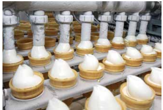
Icecream production line

In the agricultural, farming and fishing industry, portable instruments are replacing historically used grade scales (for example Meat classification, Salmon colour, Egg Yolk colour) based on non subjective visual assessment by objective colour measurement. Konica Minolta Sensing has for more than 30 years, been a leading provider of colour management solutions to the food, ingredients and beverage industry supplying state of the Art instruments and solutions to assure objective and reliable colour control. Either for portable use in the field or daily routine measurements in the laboratory, Konica Minolta offers a wide range of products that suits the needs.