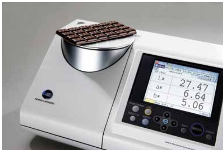
Perfect top port concept for fast and easy measurement

“With this new instrument, the user will profit in terms of higher productivity through fast and easy colour control for almost any kind of samples and applications”. In fact, the top port alignment allows the reflectance measurement of samples whether they come in solid, powder, granule, paste or liquid form. Special attention was brought to achieve maximum ease of use for daily routine measurements and thus avoiding operational mistakes in a laboratory environment with multiple users having to measure samples in various forms such as solids, paste, powders, granules as well as opaque and transparent liquids.