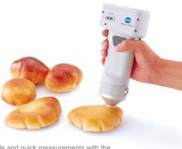
Simple and quick measurements with the Chroma-Meter CR-400

easy and even more important with a minimum of preparation time, a large range of dedicated optional accessories such as glass cells, Petri-dish's and sample holders are available. Other reasons for the popularity of the Konica Minolta Chroma-Meter's is their portability enabling measurements "in the field" as well as their robustness and reliability to sustain even harsh operational conditions.