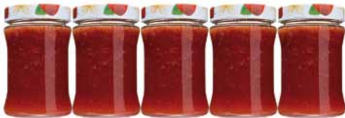
Perfect colour match at the Point of Sale

Compared to the variety of other parameters which require accurate analytical monitoring in a food laboratory, the fresh, appealing and appetizing colour of foods and beverages represent the only and immediately perceptible “quality” aspect. It therefore deserves the appropriate attention through objective and repeatable measurement methods from raw materials, ingredients down to the final product.